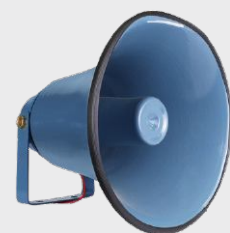
JR-HSA-10/20/25/30/35 Broadcast Horn