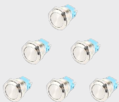
Button Multiple Options Available